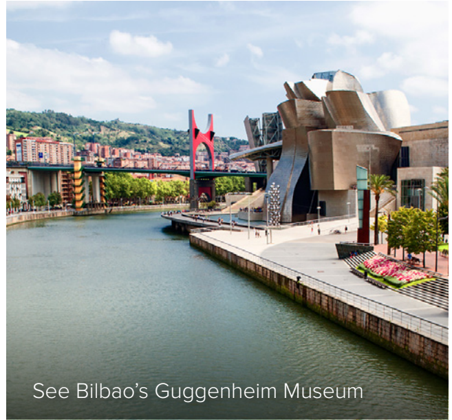
See Bilbao's Guggenheim Museum