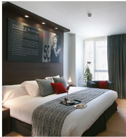
Astoria7 Hotel Movie-star style in San Antonio Don't miss the film-themed library