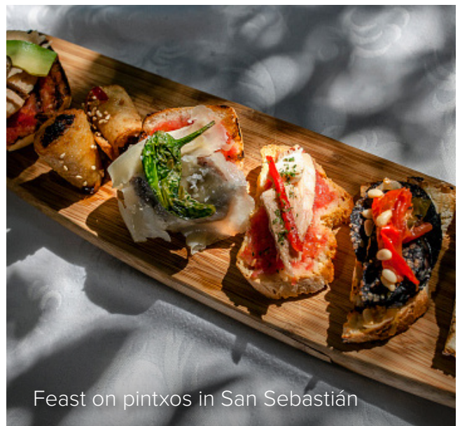
Feast on pintxos in San Sebastián