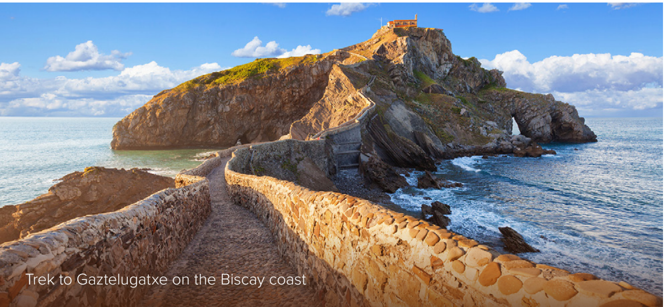
Trek to Gaztelugatxe on the Biscay coast