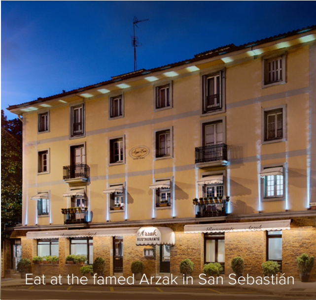
Eat at the famed Arzak in San Sebastián