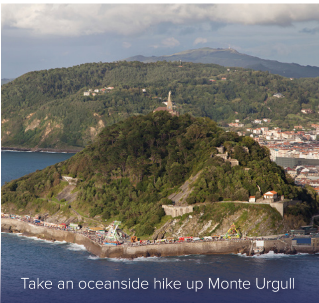
Take an oceanside hike up Monte Urgull