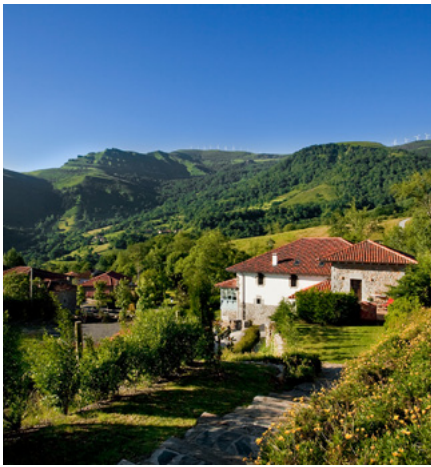
Casona de Quintana Cultured country house Don't miss Nuria's home-cooking