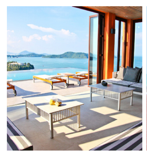
Sri Panwa Tranquil tropical villas Don't miss starlit soaks in your tub