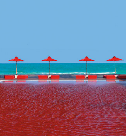
The Library Novel beach hideaway Don't miss that blood-red pool