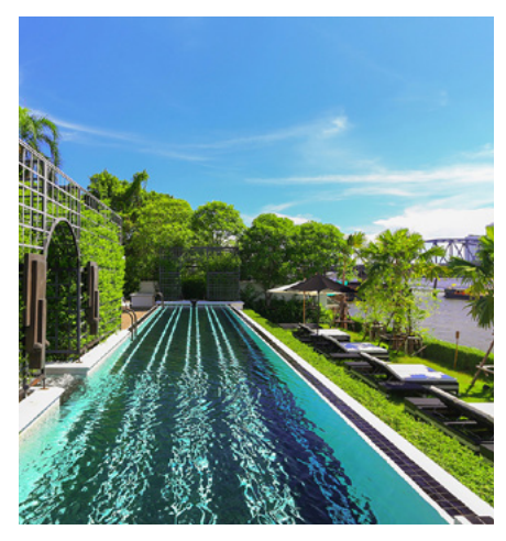
Siam Hotel Handsome riverside hideout Don't miss a Muay Thai class