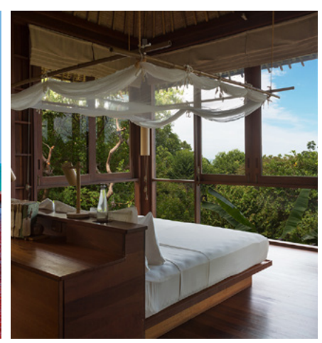
Six Senses Samui Ravishing rainforest escape Don't miss a wave-side meal